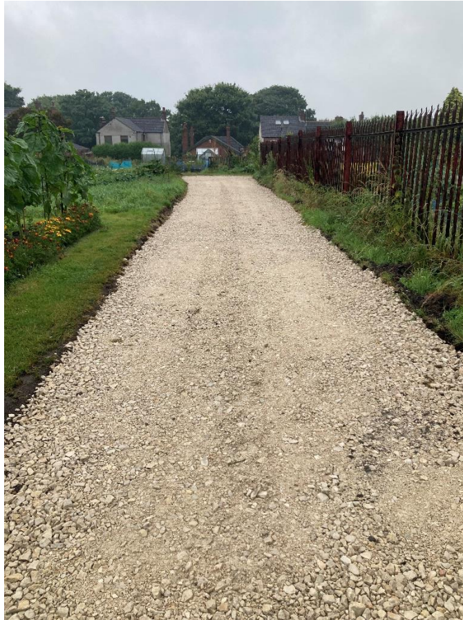
Photograph 4 - Access and cart road surfacing improvements on Water Lane Allotments