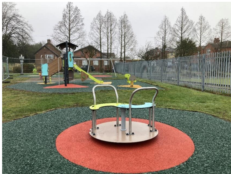
Photograph 1 – Queensway Park Play Equipment