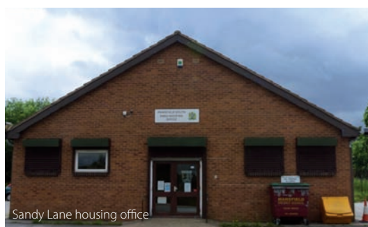
Sandy Lane housing office