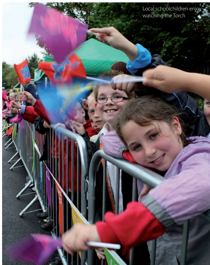
Local schoolchildren enjoy watching the Torch