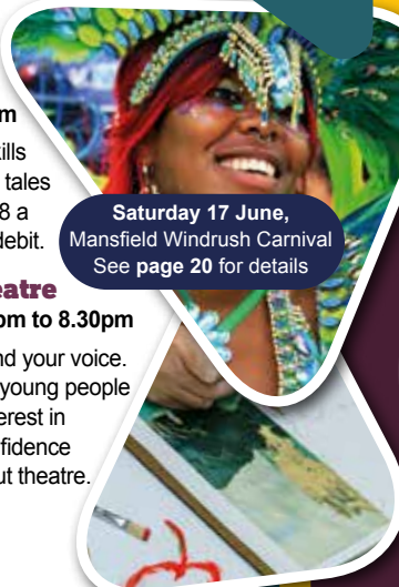
Saturday 17 June, Mansfield Windrush Carnival See page 20 for details

This group is all about making new plays as a theatre company. Perfect for those with an interest in comedy, writing or performing. No experience is necessary and the group welcome new friends with open arms. £70 a term by monthly direct debit.