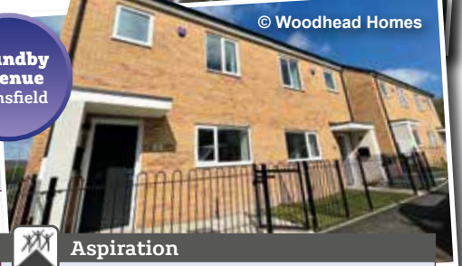
Saundby Avenue Mansfield