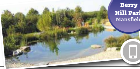
Berry Hill Park Mansfield