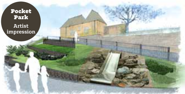
Pocket Park Artist impression

All these council projects have been paid for by £1m of Towns Fund accelerated funding topped up by funds from Severn Trent to include Sustainable Drainage Systems (SuDS) such as rain gardens and permeable paving to soak up rainwater.