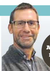
Andy Abrahams Executive Mayor

We welcome your feedback on this magazine - email publicrelations@mansfield.gov.uk or contact 01623 463021 . You can read the magazine online at www.mansfield.gov.uk/mymansfield . If you require help with this document or would like it in a different format, please contact us.