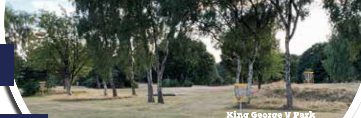
King George V Park

An exciting new golf attraction has been installed at Mansfield's award-winning King George V Park.