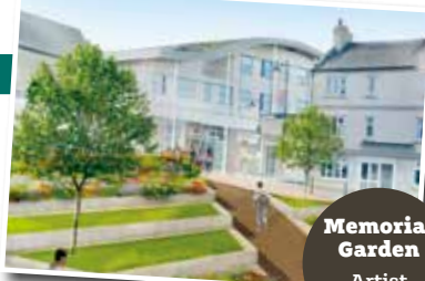
Memorial Garden Artist impression

As part of a wider Mansfield District Council Urban Greening project in the town centre, a pocket park with a slide for youngsters is being created on the grassy slope on the corner of Walkden Street and Quaker Way.