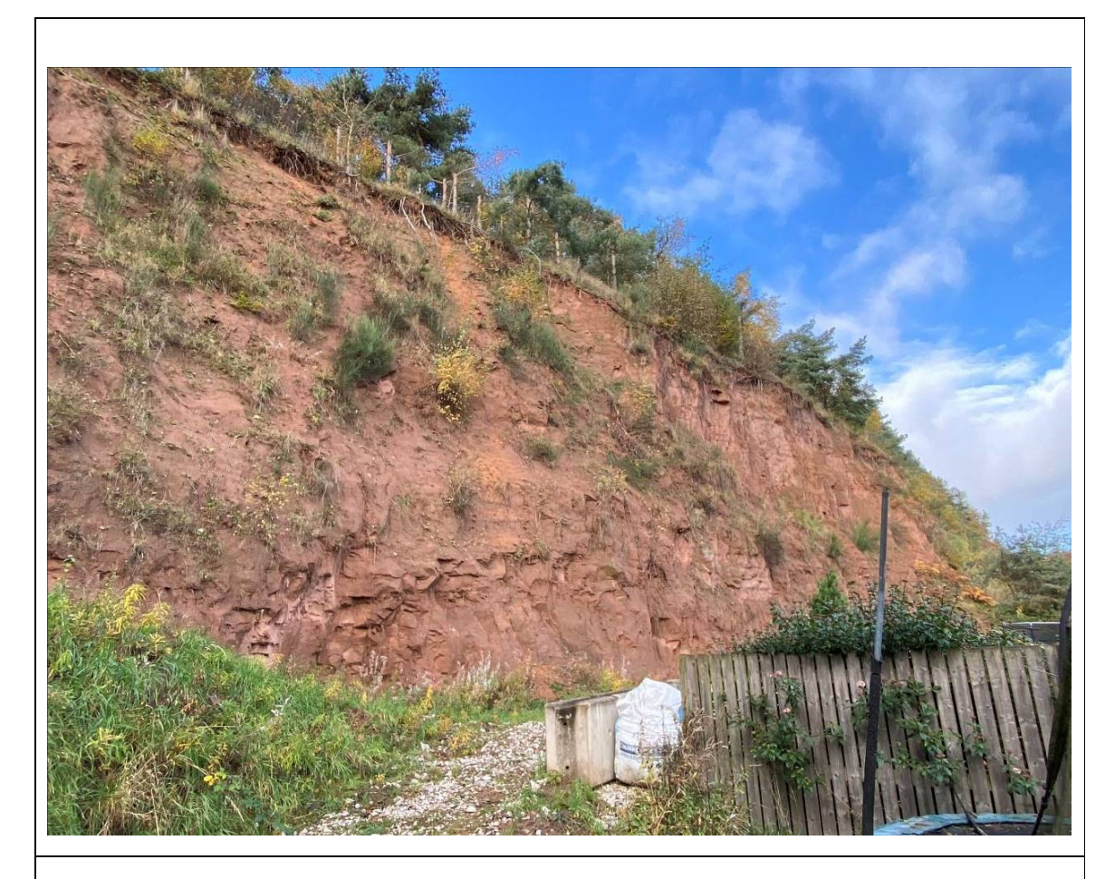
Photograph 4: Looking at the western flank. Note towards the centre of picture the orange streak of sand being washed down the cliff face from what appears to be the soil crust at the crest of the cliff. This is creating talus and sand mound at the toe of the cliff (Image taken on 03/11/2020).