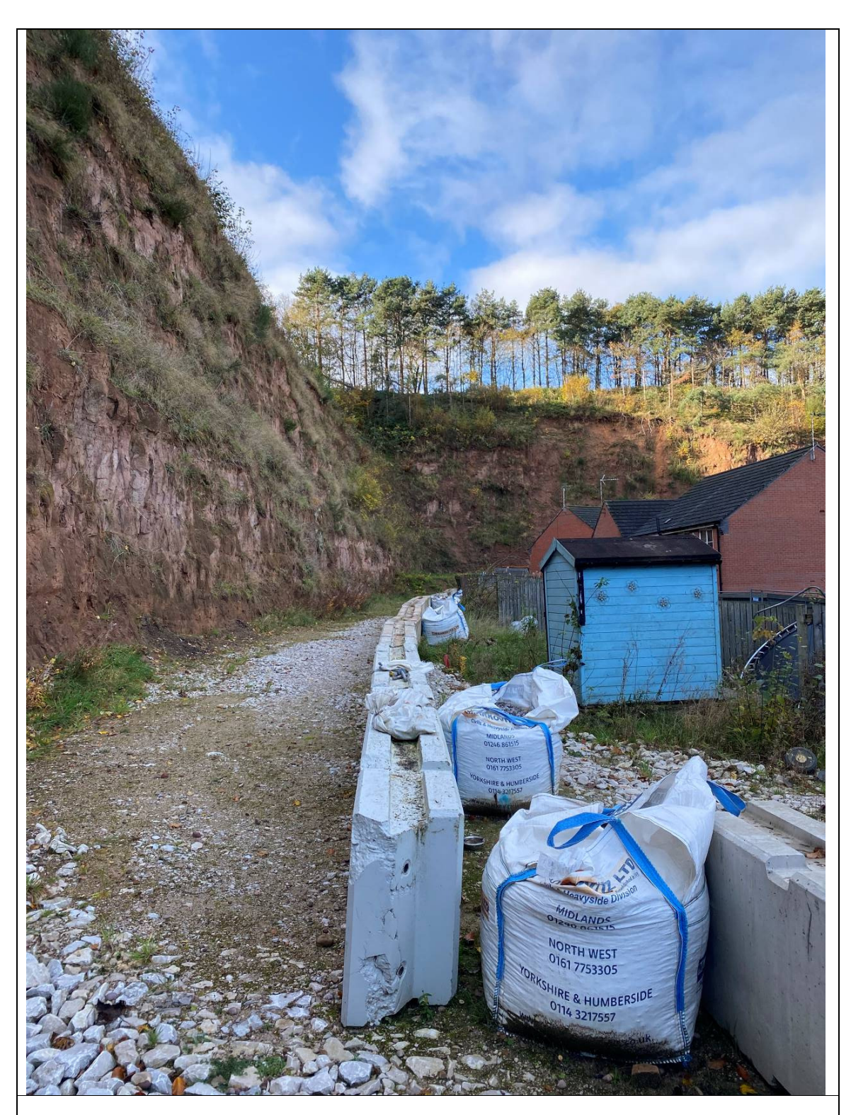
Photograph 1: Looking along the southern flank of the quarry to the south west corner (Image taken on 03/11/2020)