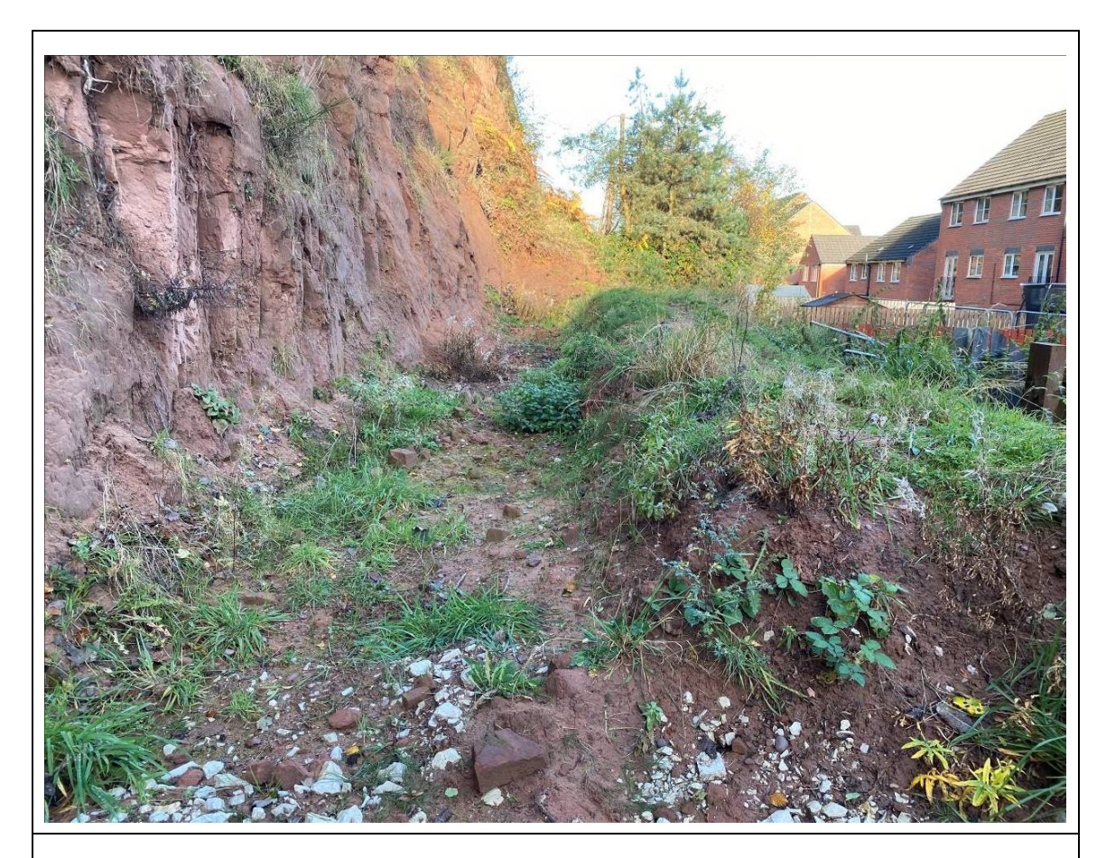
Photograph 6: Looking north to the end of Unit 8. The western flank is to the left-hand-side of the photograph with temporary earthwork bund and rock trap next to it. Note the scattering of small <30cm³ unravelled sandstone blocks in the rock trap. (Image taken on 03/11/2020).