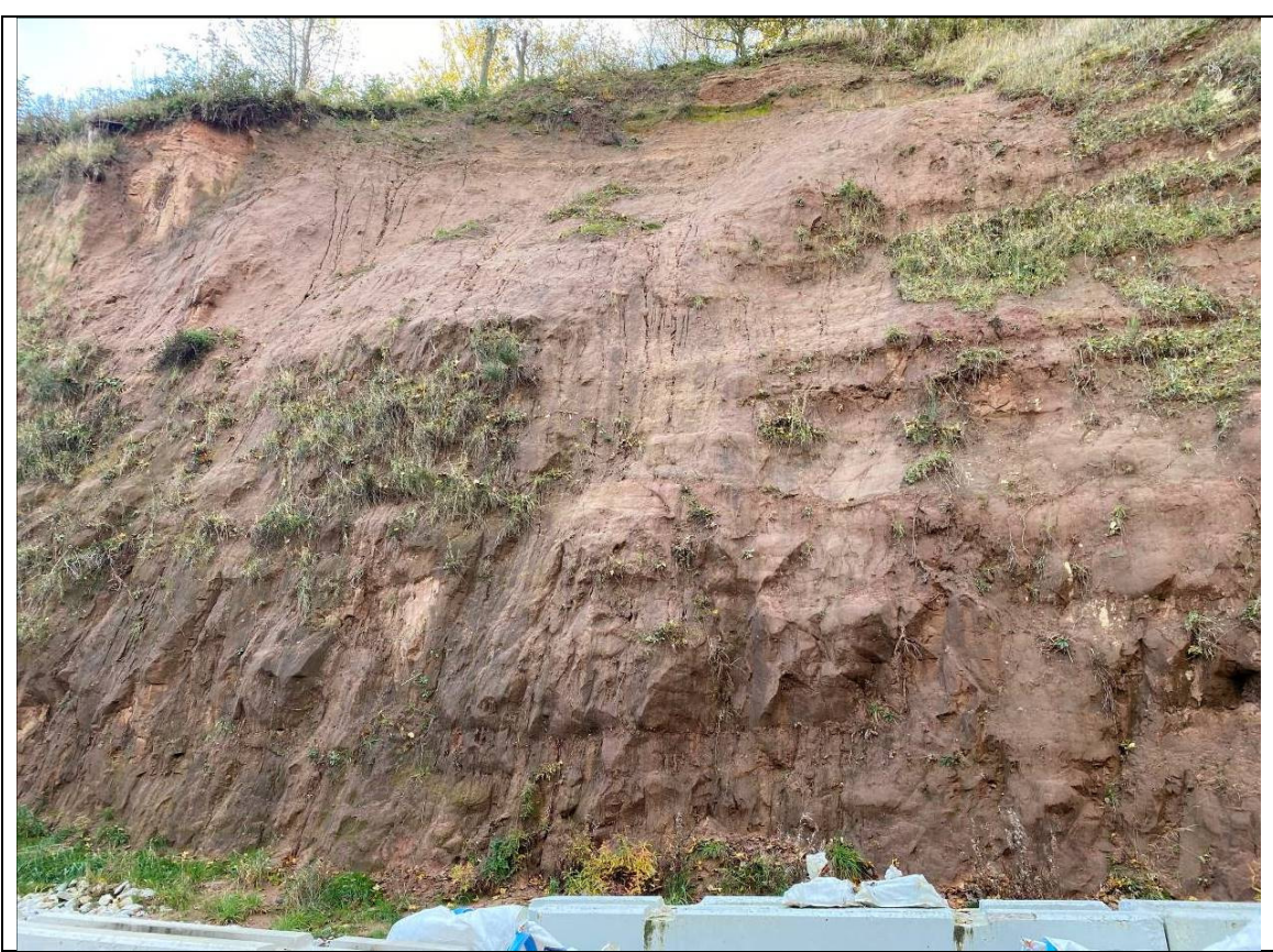
Photograph 2: Previous failure scar (Image taken on 03/11/2020)