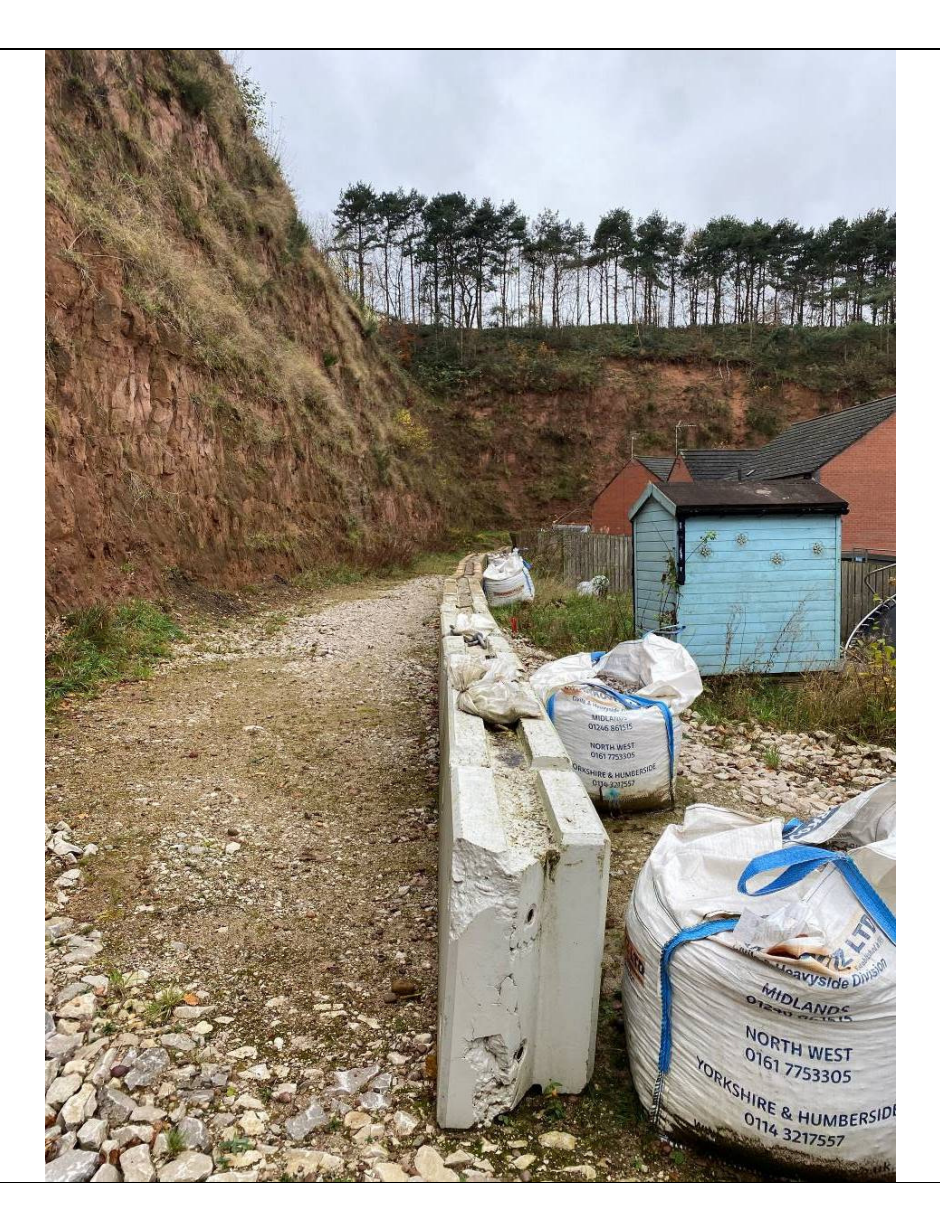
Photograph 1 : Looking along the southern flank of the quarry to the south west corner (Image taken on 17/11/2020)