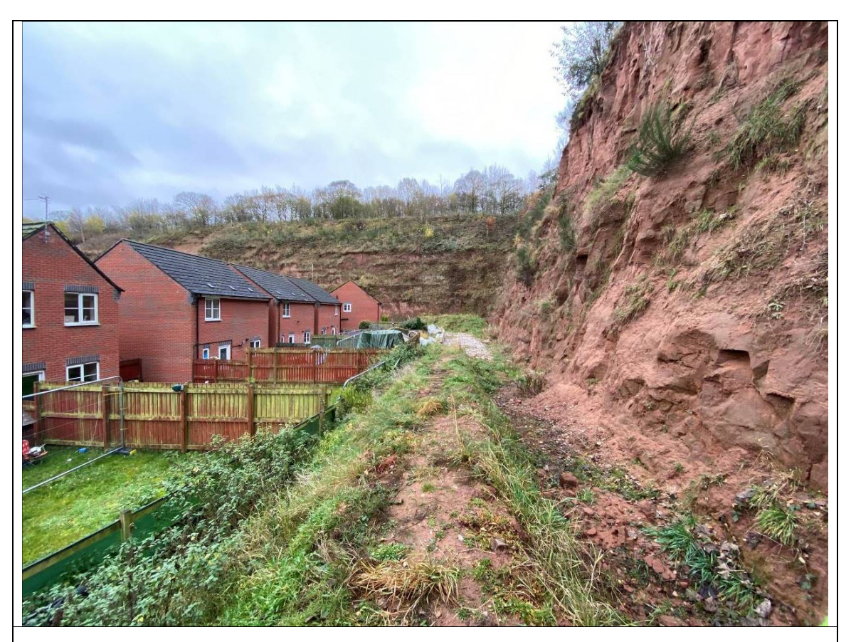
Photograph 5 : Looking at southern flank (background) and western flank (right-hand-side) (Image taken on 17/11/2020)