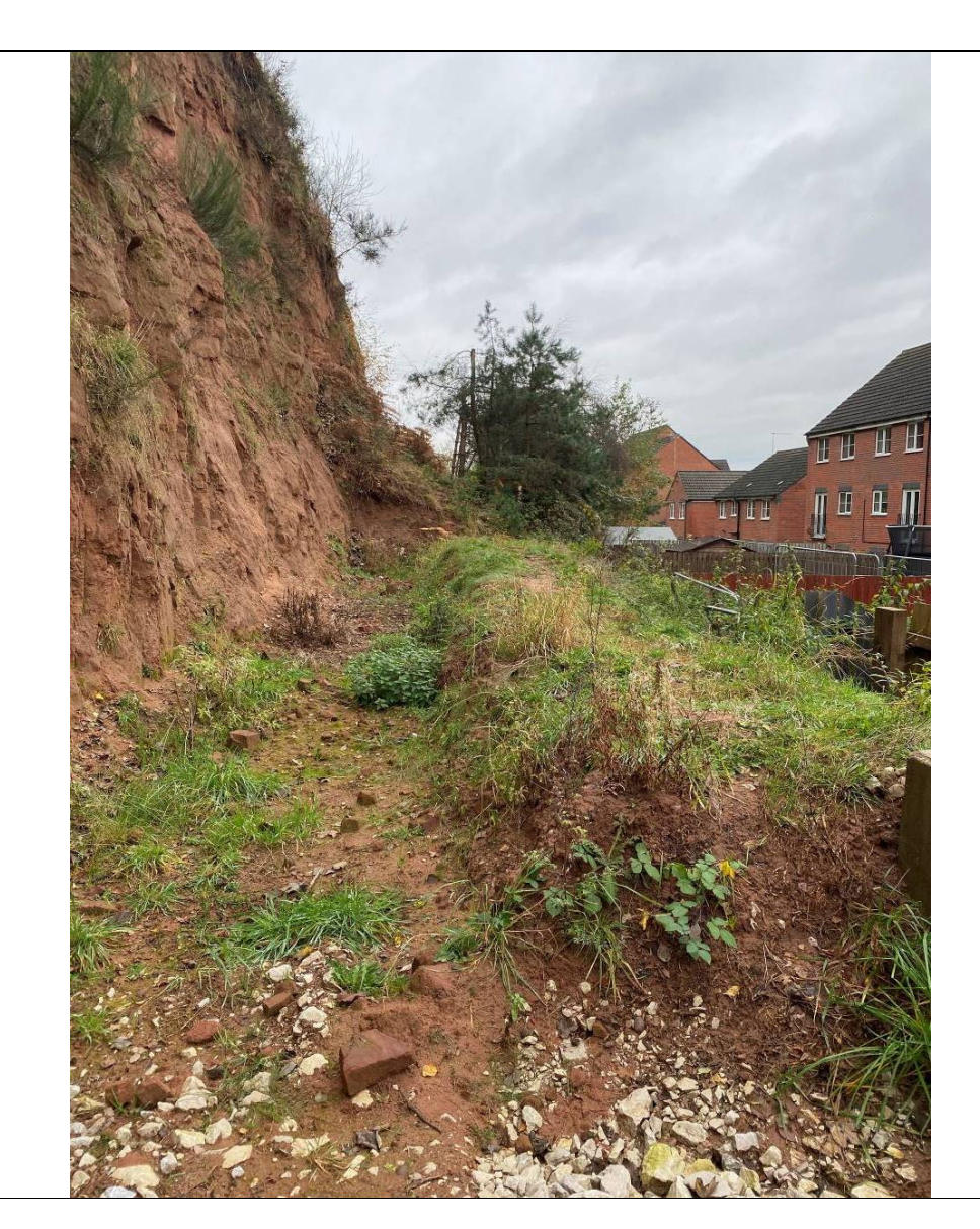
Photograph 6: Looking north to the end of Unit 8. (Image taken on 17/11/2020).