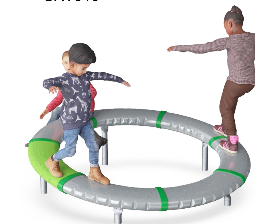
4. Galaxy Supernova GXY916