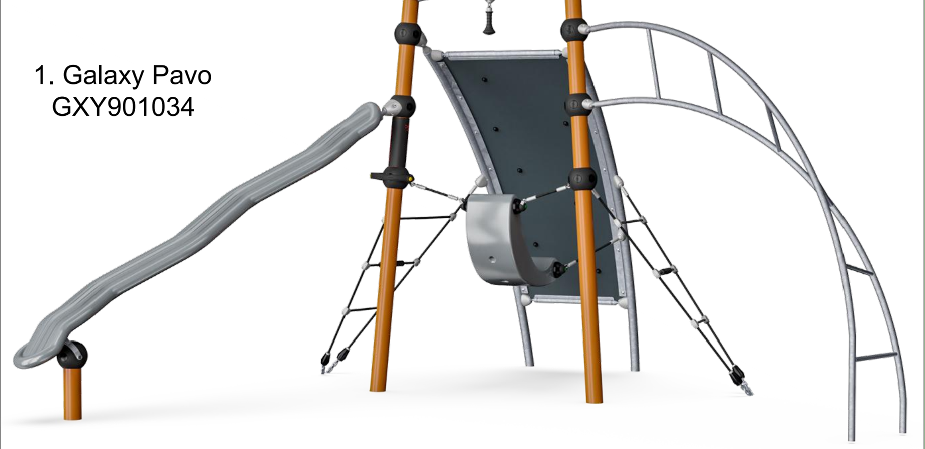
1. Galaxy Pavo GXY901034