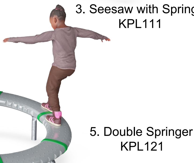
5. Double Springer KPL121