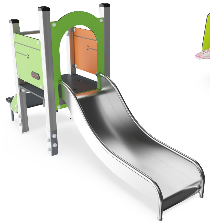
6. Toddler Tower & Slide KPL-CUSTOM 20081418