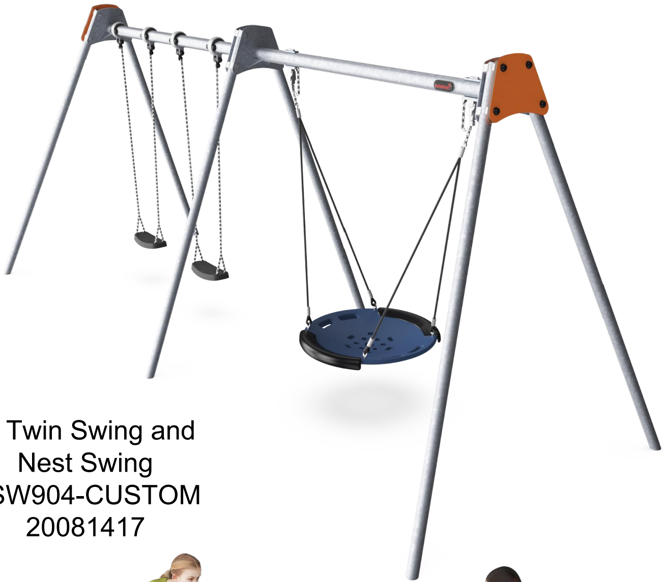
2. Twin Swing and Nest Swing KSW904-CUSTOM 20081417