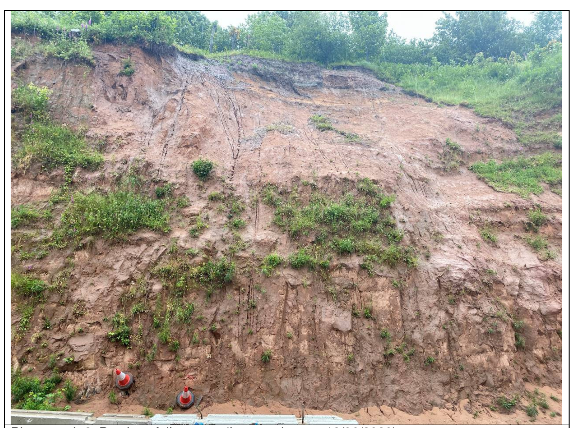
Photograph 2: Previous failure scar (Image taken on 18/06/2020)