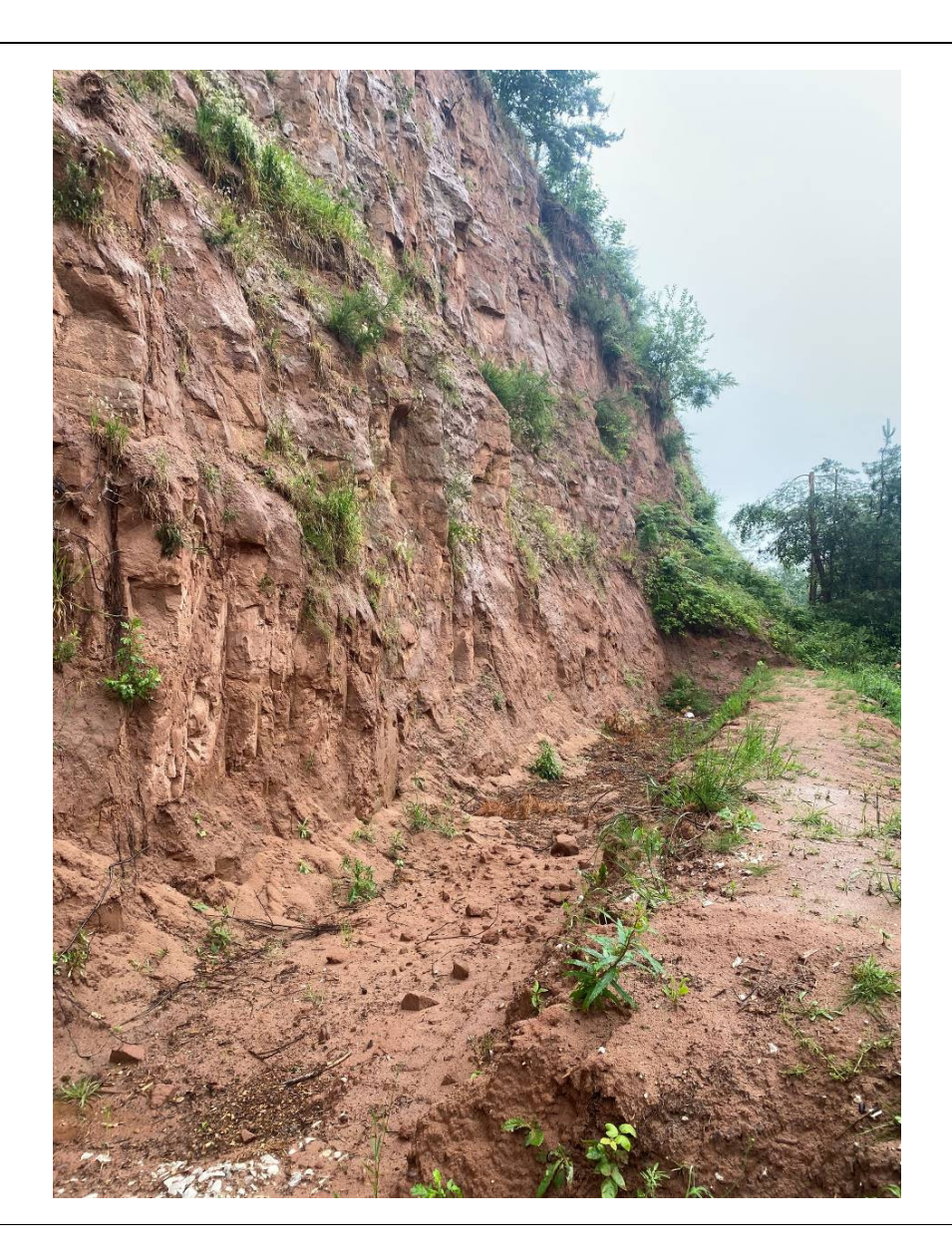
Photograph 5: Looking north to the end of Unit 8. (Image taken on 18/06/2020).