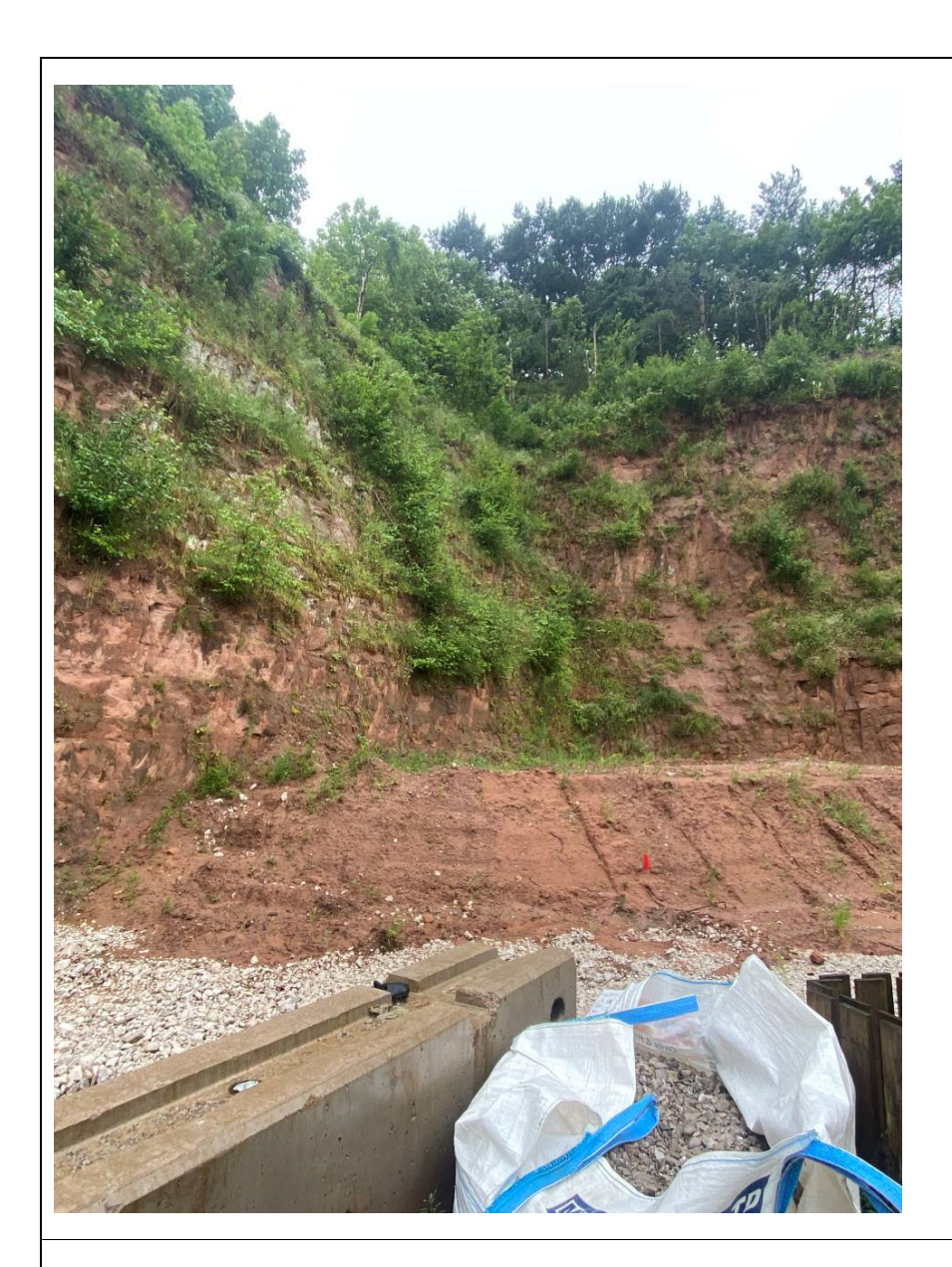
Photograph 3: Looking west to the south west quarry corner (Image taken on 18/06/2020)