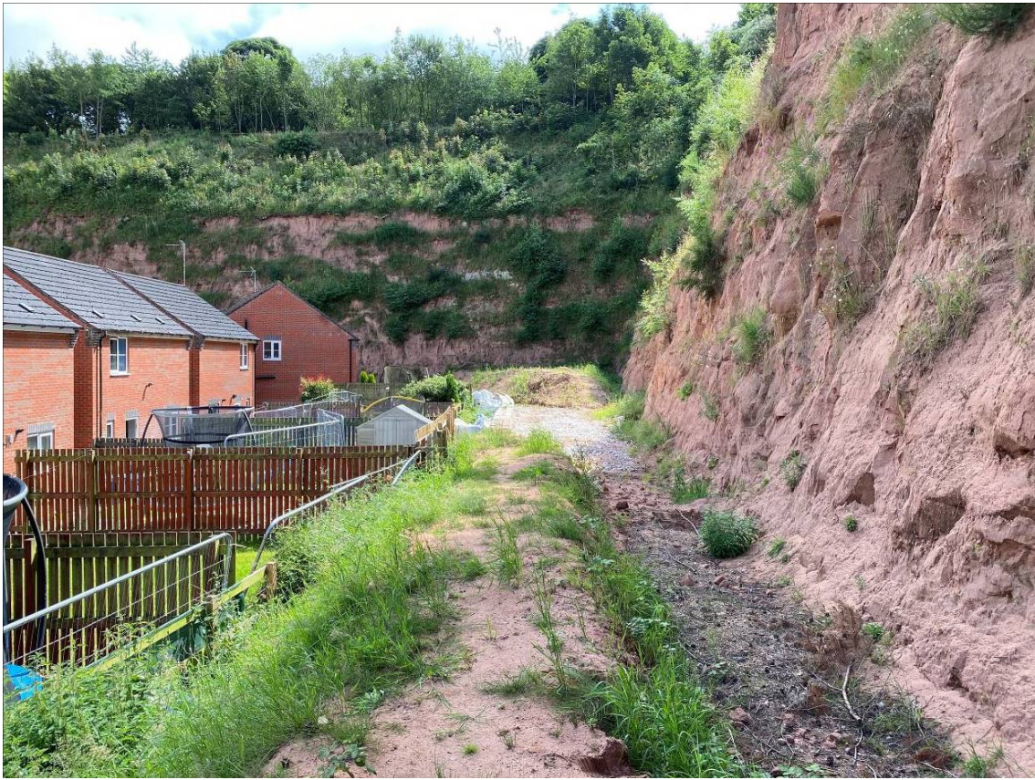
Photograph 4 : Looking at western flank and previous failure scar (Image taken on 17/07/2020)