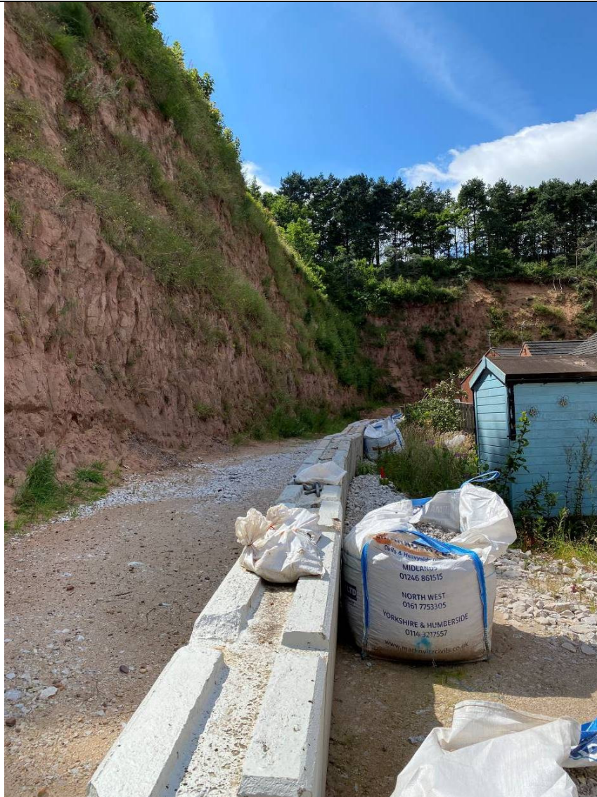
Photograph 1 : Looking along the southern flank of the quarry to the south west corner (Image taken on 17/07/2020)