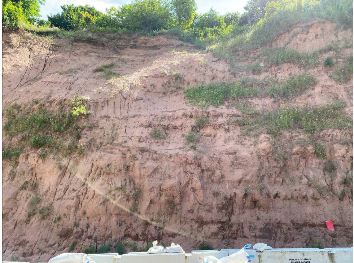
Photograph 2: Previous failure scar (Image taken on 17/07/2020)