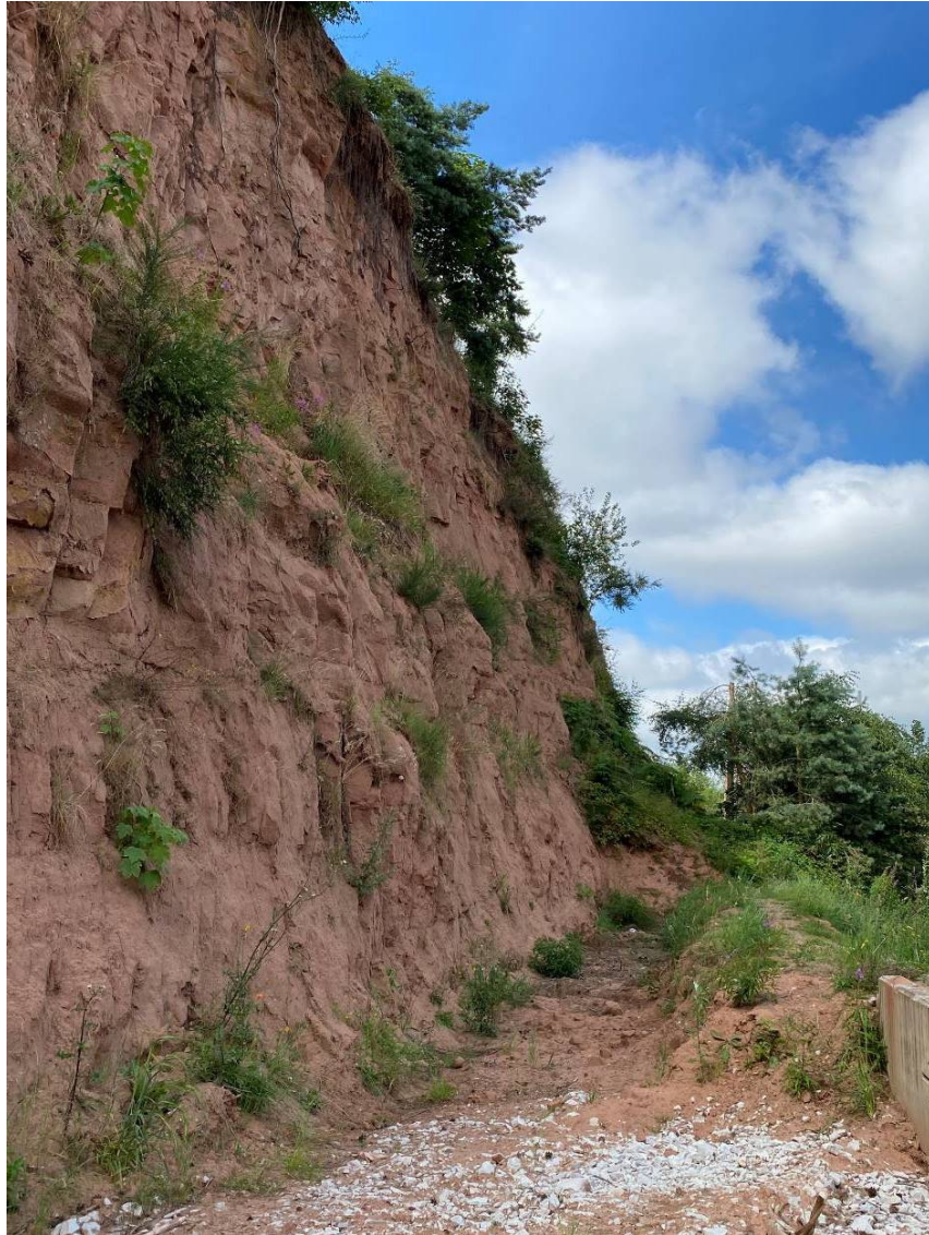
Photograph 5: Looking north to the end of Unit 8. (Image taken on 17/07/2020).