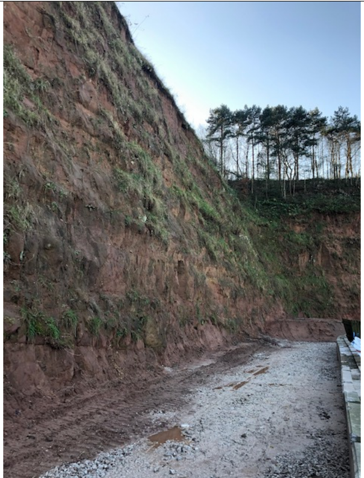
Photograph 3 : Looking west to the south west quarry corner