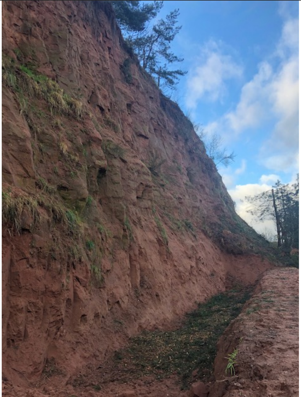
Photograph 5 : Looking north to the end of Unit 8