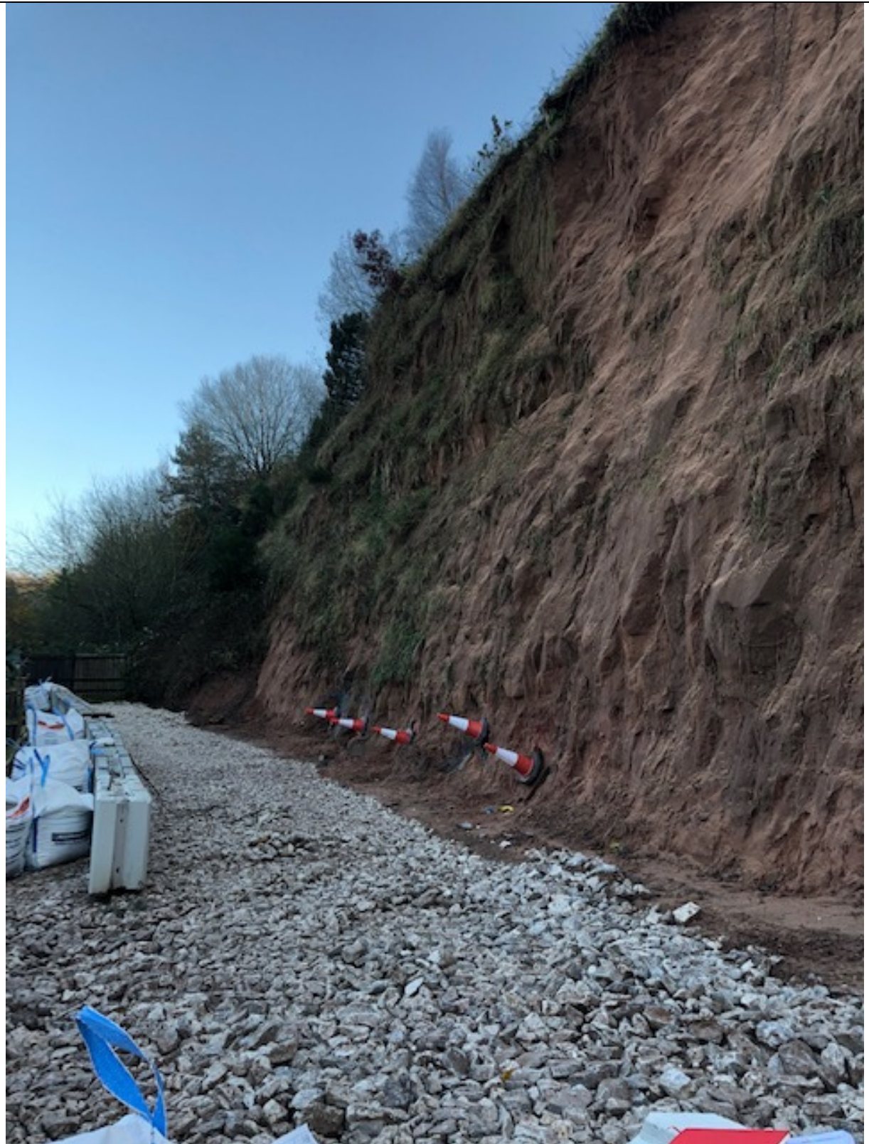
Photograph 2: looking to the eastern end of the temporary works