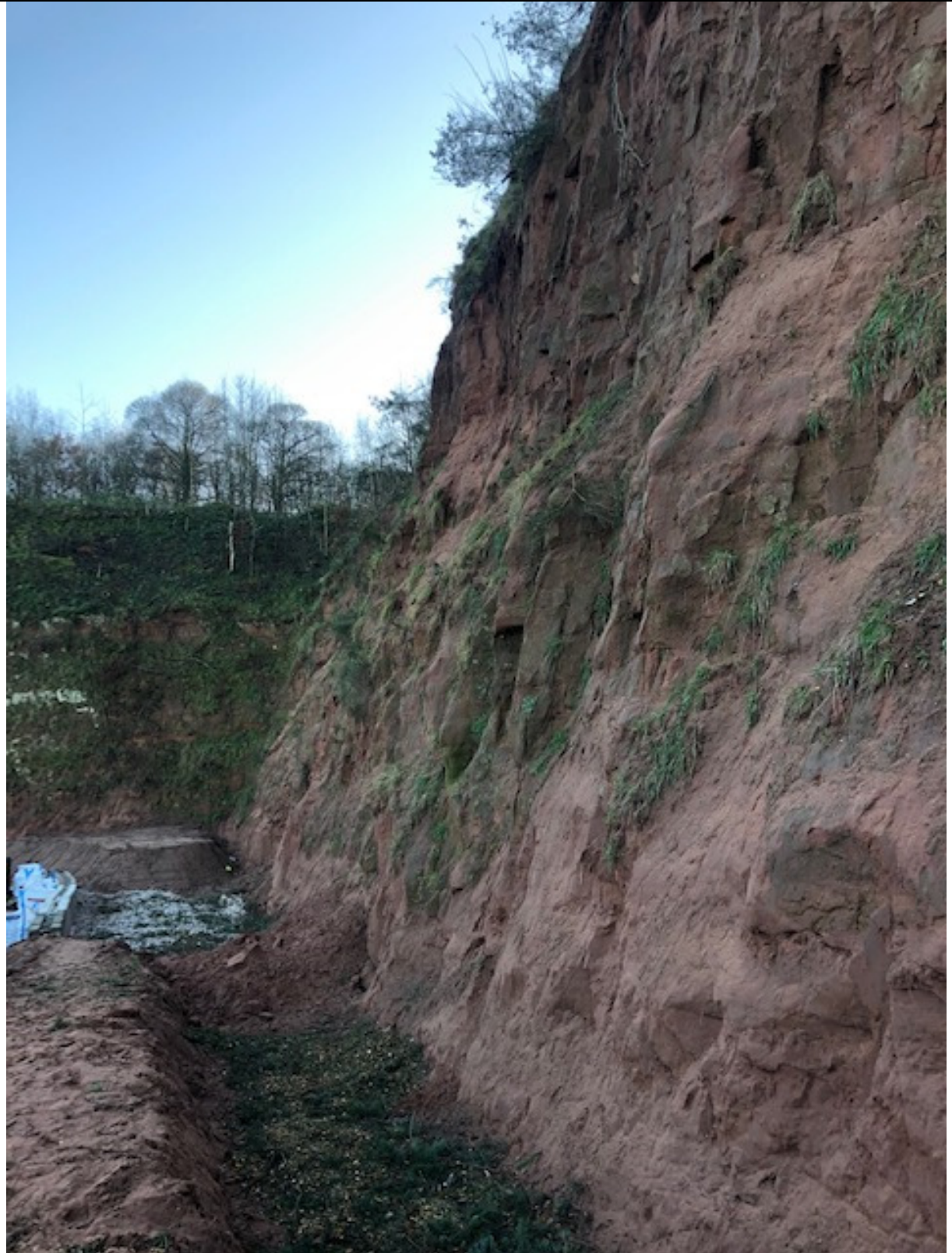
Photograph 6 Looking south to the south western corner