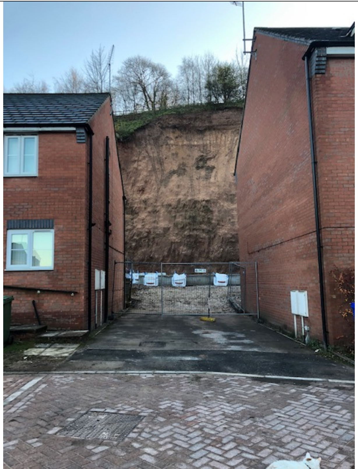
Photograph 1 : Location of mass failure from 5 th November 2019