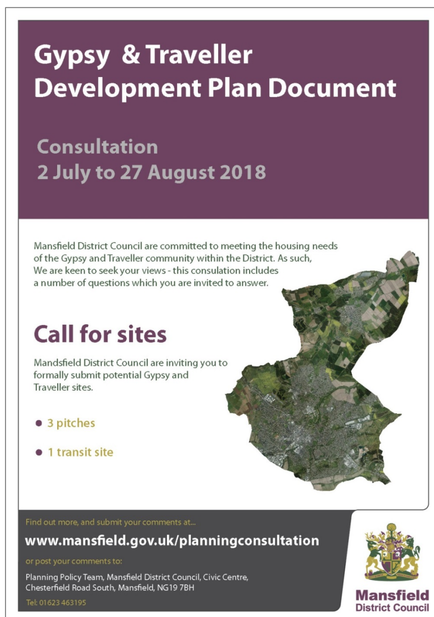
Figure 2: Consultation Poster

A1.2.5 A poster publicising the consultation event was displayed at the locations listed in section 1.2.2.