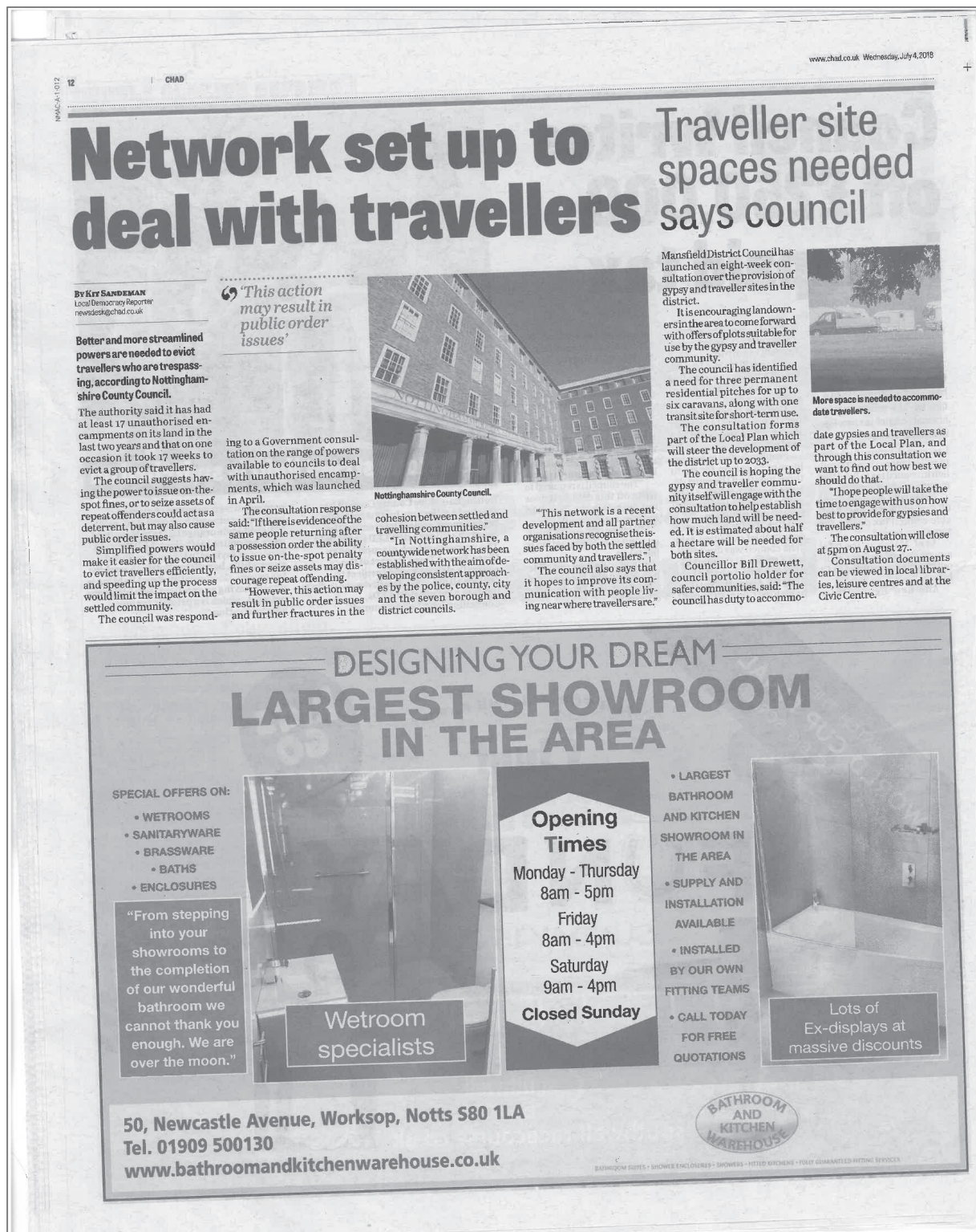
Figure 3: Public Notice

A1.2.6 A public notice was advertised in the Mansfield Chad local newspaper. This provided details on the consultation including the purpose of the event and where copies of the documents would be available for viewing.