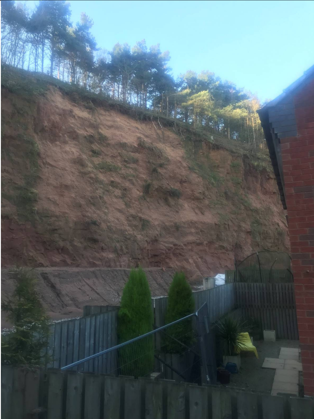
Photograph 4 : Looking at western flank and previous failure scar (Image taken on 03/01/2020)