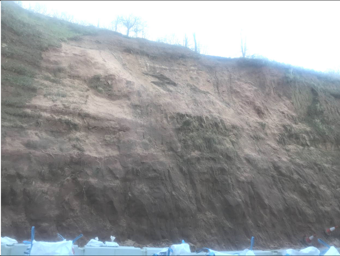
Photograph 2: Previous failure scar (Image taken on 03/01/2020)