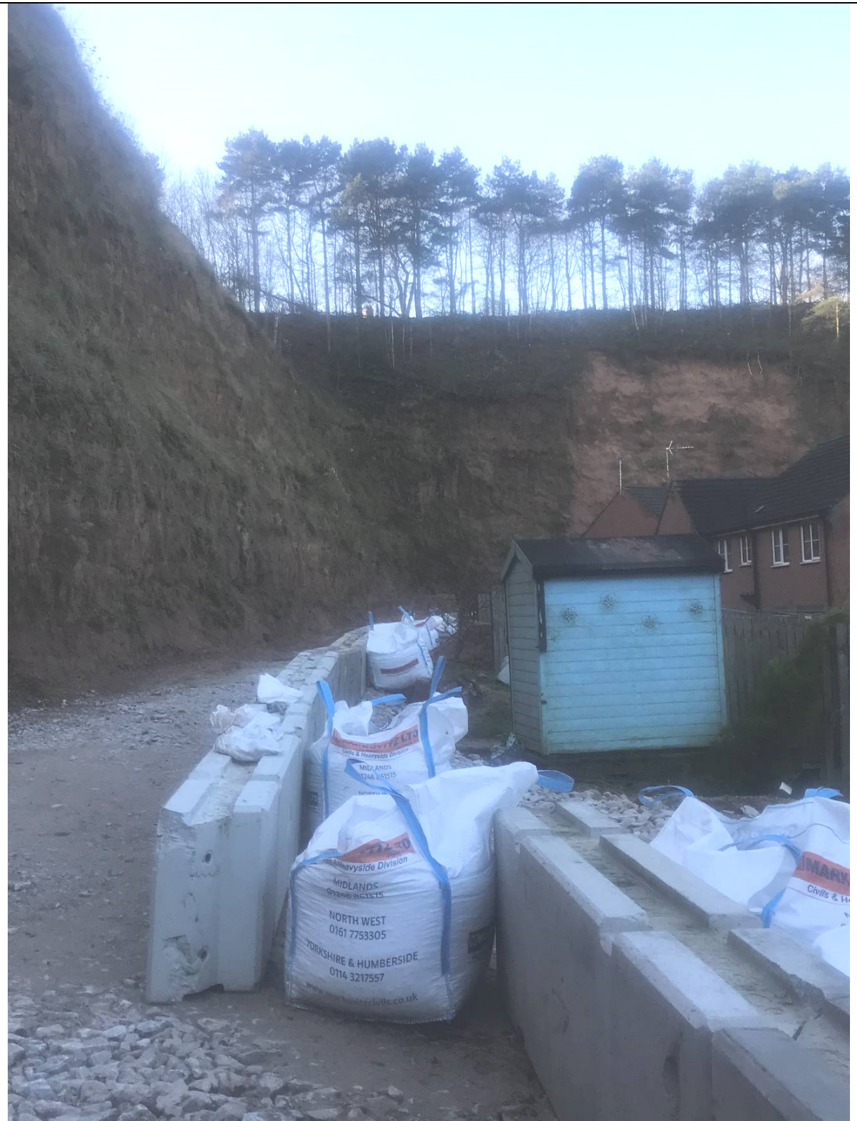
Photograph 1 : Looking along the southern flank of the quarry to the south west corner (Image taken on 03/01/2020)