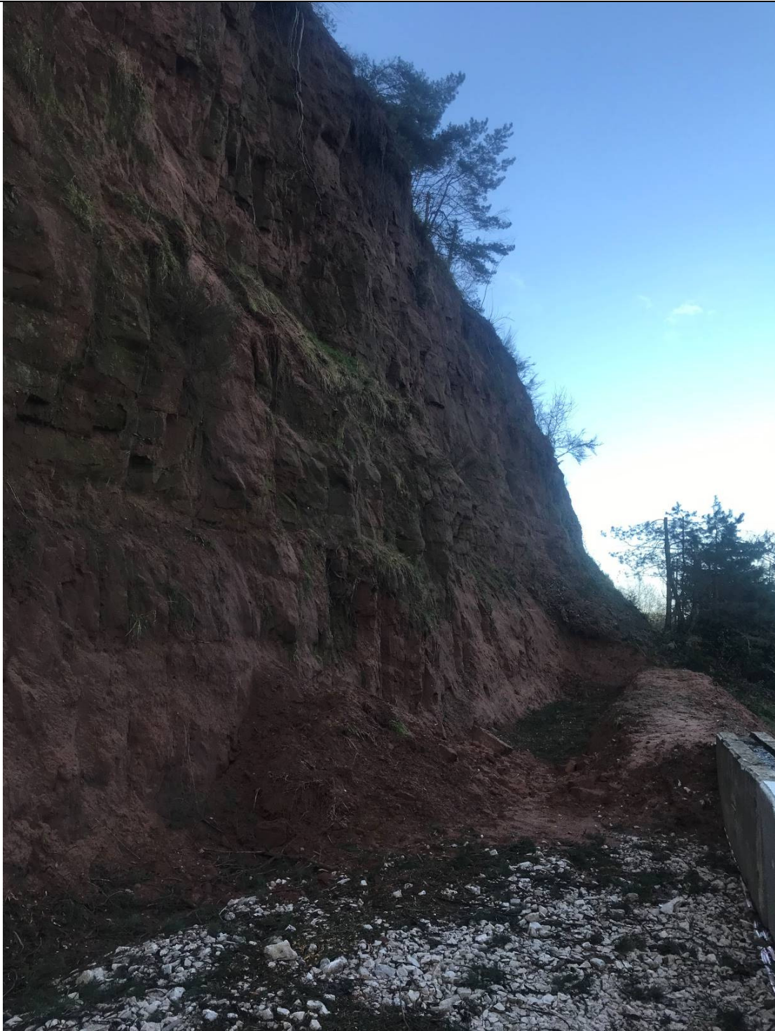
Photograph 5: Looking north to the end of Unit 8. Debris from small failure reported on the 24 th November 2019. Note two grass clumps, approx. 30cm 2 on top of the previous small failure (Image taken on 03/01/2020).